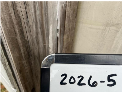
2026-5 Caulk Typical Exterior Doors/Windows