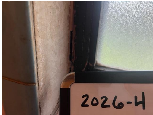
2026-4 Caulk Typical Interior Windows