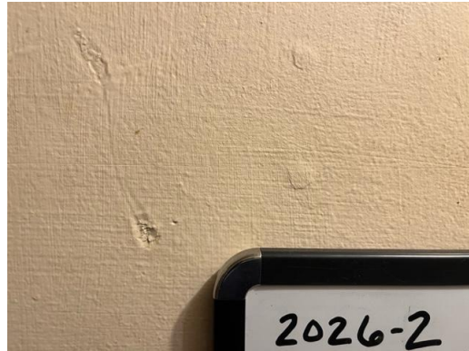
2026-2 Drywall/Joint Compound Typical Interior Walls/Ceilings