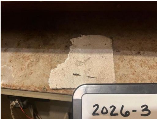
2026-3 Duct Insulation (45% Chrysotile) Typical Interior HVAC