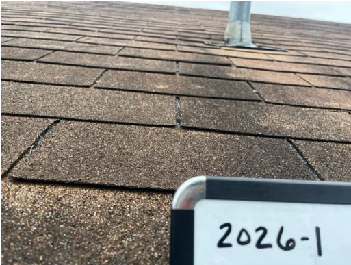
2026-1 Asphalt Shingle Typical Exterior Roof